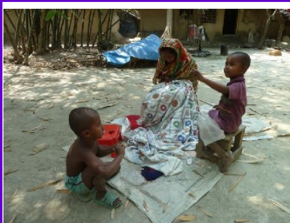
A wman is sewing kantha ( Embroidery work)