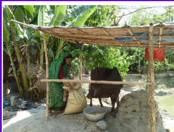
A woman is taking care domestic animal (Cow)