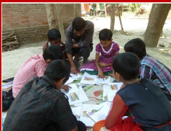
Teacher is helping student to prepare home task