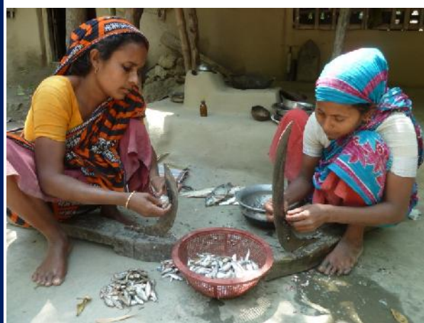
Women are doing house hold work