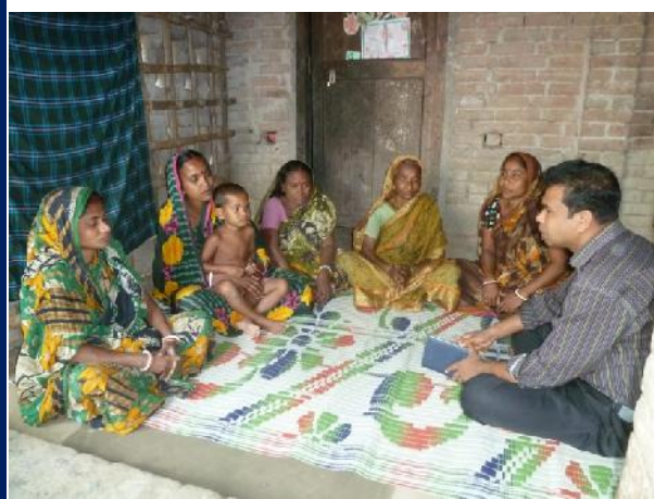
Teacher conducted meeting during home visit